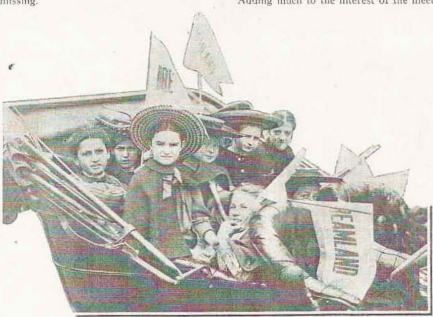
LOAD OF TEN LITTLE ORPHAN GIRLS ON THEIR WAY TO DREAMLAND.